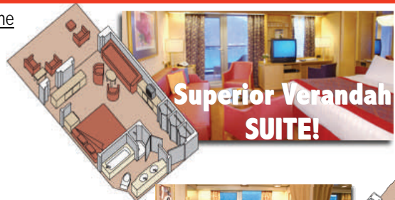
Superior Verandah SUITE!